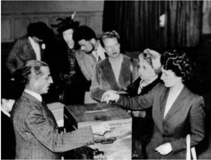
Image: Voting in general elections seemed right in 1946. But in the complex world of the 21st century is it time for a far more direct way of doing democracy? Link to larger image. Image: Voting in general elections seemed right in 1946. But in the complex world of the 21st century is it time for a far more direct way of doing democracy?