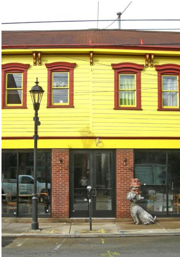
Millvale Library / Hive Pittsburgh