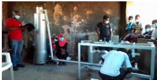
4 - Installation of the bioenergy cooker at Mary's Meals kitchen at Chilimba Primary school at Mbandu village.

After completion of the project, the system will stay in the school and will be a permanent asset for the Mbandu community. The project will end in March 2021 and it is hoped it will leave a lasting legacy in the village.