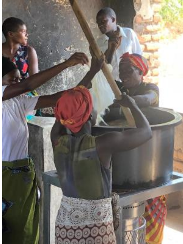
3 - Piloting phase - no firewood used for cooking this porridge, just organic waste, mostly rice husks which are readily available in the area.