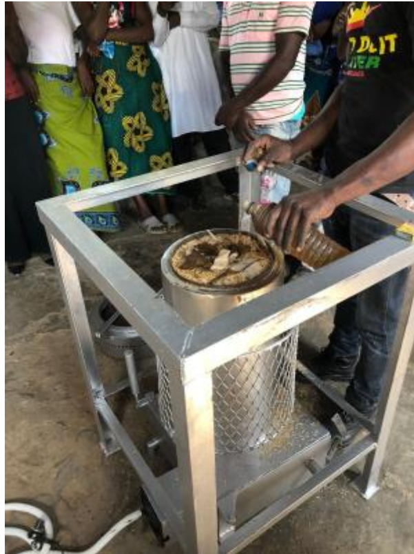
1 - Piloting phase - no firewood used for cooking this porridge, just organic waste, mostly rice husks which are readily available in the area.