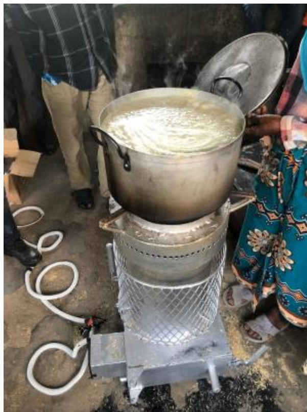
2 - Piloting phase - no firewood used for cooking this porridge, just organic waste, mostly rice husks which are readily available in the area.