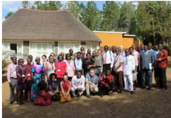
6 - SFA Symposium in Lira, Uganda | February 2019

Stay tuned for more news and updates about the SFA Digital Symposium!